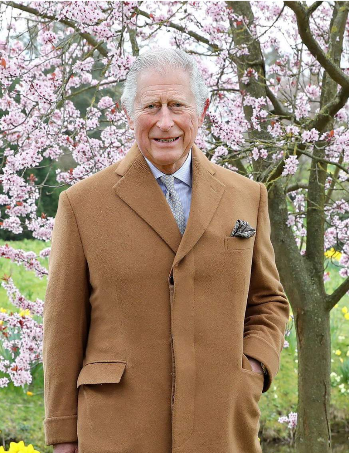
His Majesty, King Charles III