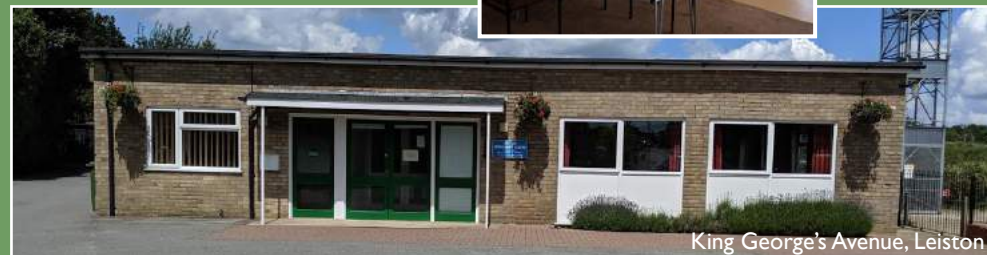
King George's Avenue, Leiston